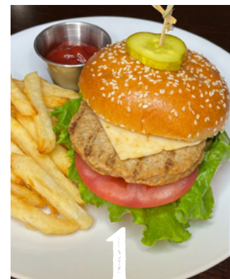
1 Turkey Monterey Jack Burger

One Product | Multiple Menu Applications