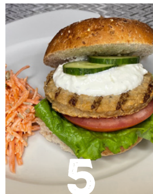
5 Mediterranean Turkey Burger