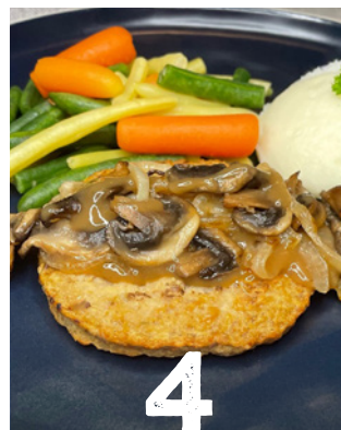
4 Smothered Turkey Steakette with Mushrooms & Onions