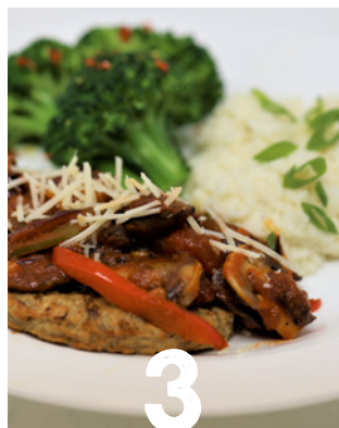
3 Turkey Milanese